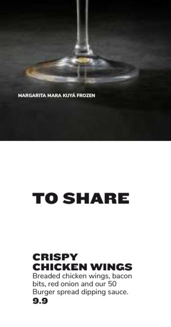
MARGARITA MAMA KIVA FROZEN

GOIKO FRESH LEMONADE Perfect for summer, our own lemonade homemade version. Natural lemonade slushy, with a hint of fresh mint. 3.9