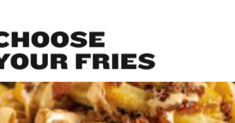
ENQESAME Y BACON

HERE, OUR FRIES ARE HAND-CUT BY US EVERY DAY AND SEASONED WITH OUR SPECIAL RECIPE.