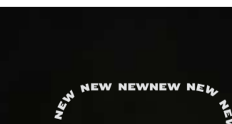
FROZEN GOIKO ORIGINAL

Creamy Red Velvet, bits of Red Velvet cake and cookie crumbles with a touch of cinnamon. 4.9